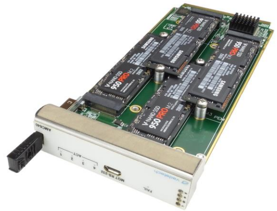
Figure 1: AMC640

The AMC640 is available in both air-cooled (MTCA.0 and MTCA.1) and rugged conduction-cooled versions (MTCA.2 or MTCA.3, contact sales for details).